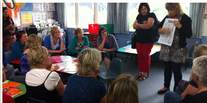
Ngongotaha teachers share their SOLO experiences